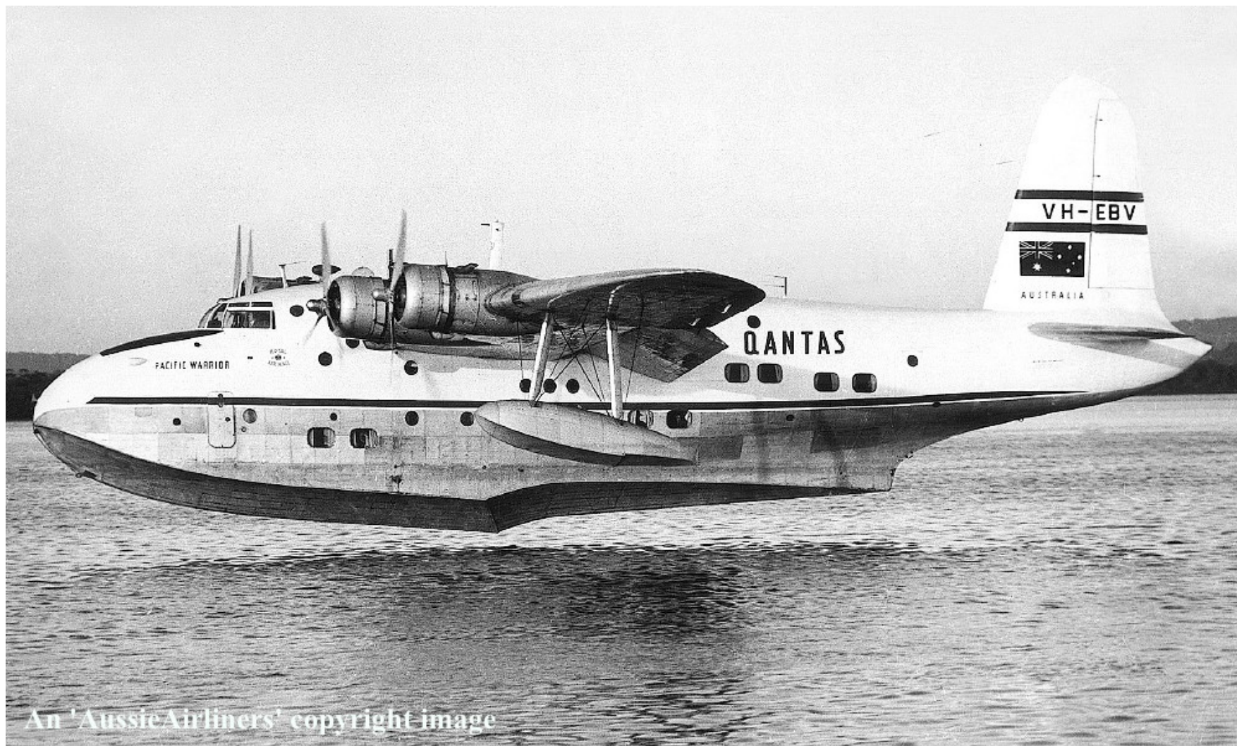
VH-EBV. Short S.25 Mk 5 Plymouth Class Flying Boat. Redlands Bay, Brisbane, circa 1953.

Qantas - 'Pacific Warrior' – revised livery and titles