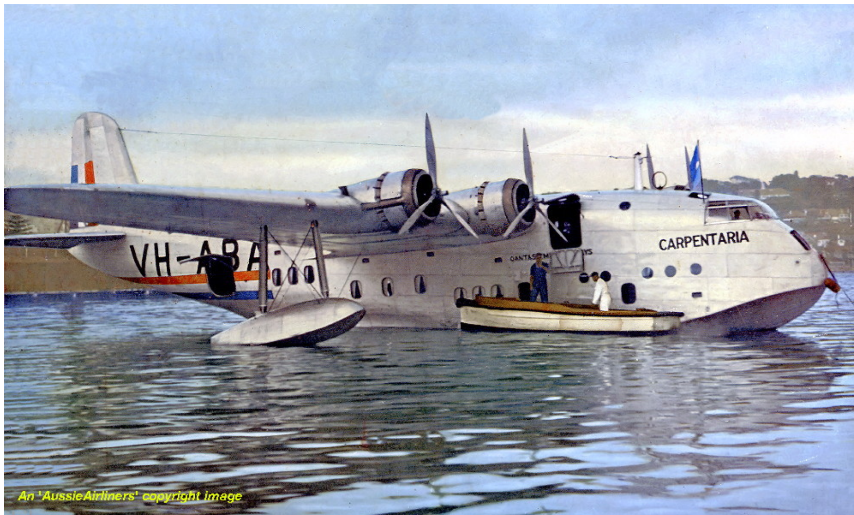
VH-ABA. Short S.23C Empire Class Flying Boat. Sydney, Rose Bay, date unknown.

Qantas Empire Airways - 'Carpentaria' - titles relocated and 'war-time' fin and fuselage flashes added