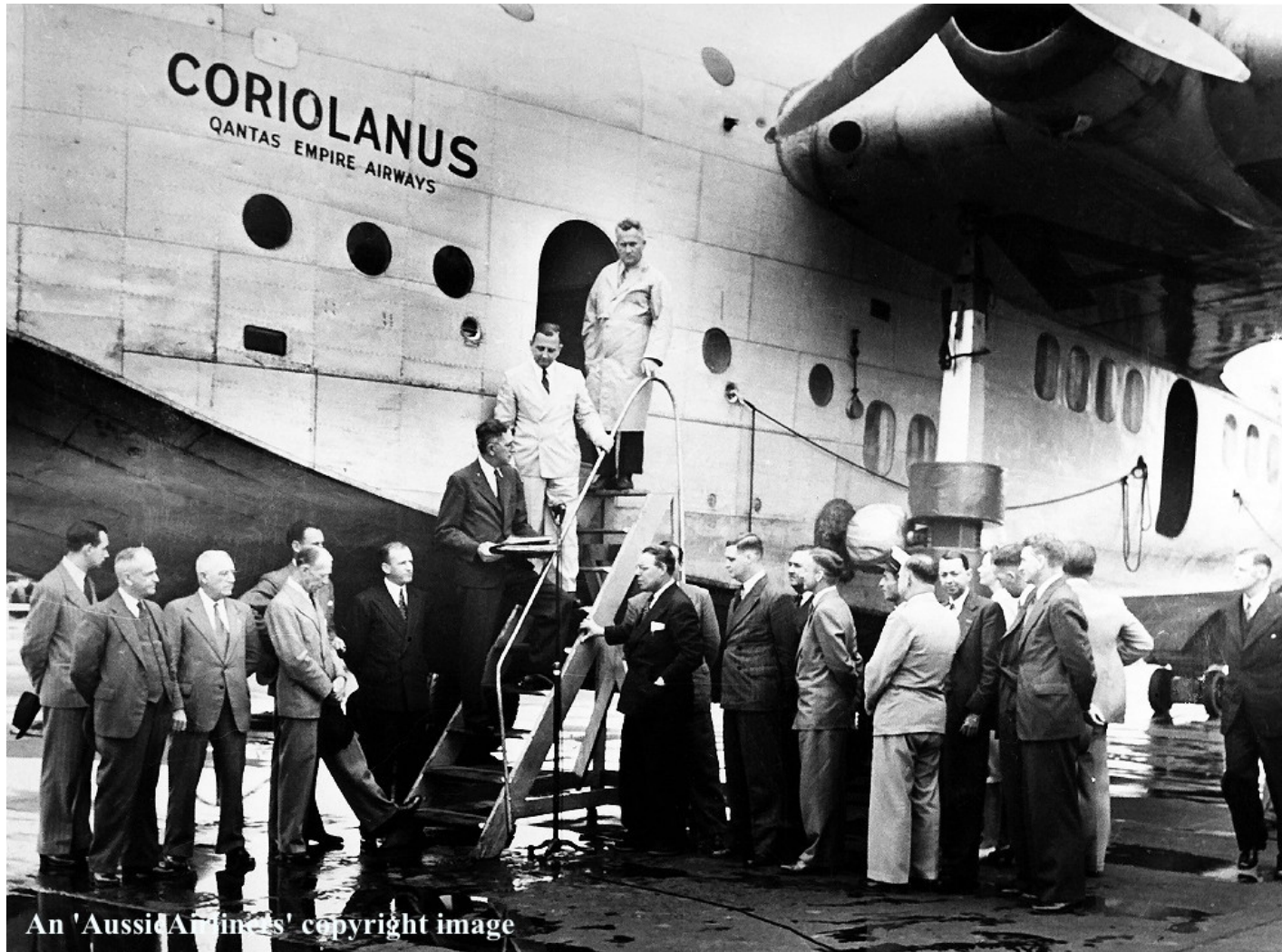
VH-ABG. Short S.23C Empire Class Flying Boat. Sydney, Rose Bay, January 08, 1948.

Qantas Empire Airways – ‘Coriolanus’ - titles relocated to below the aircraft’s name.