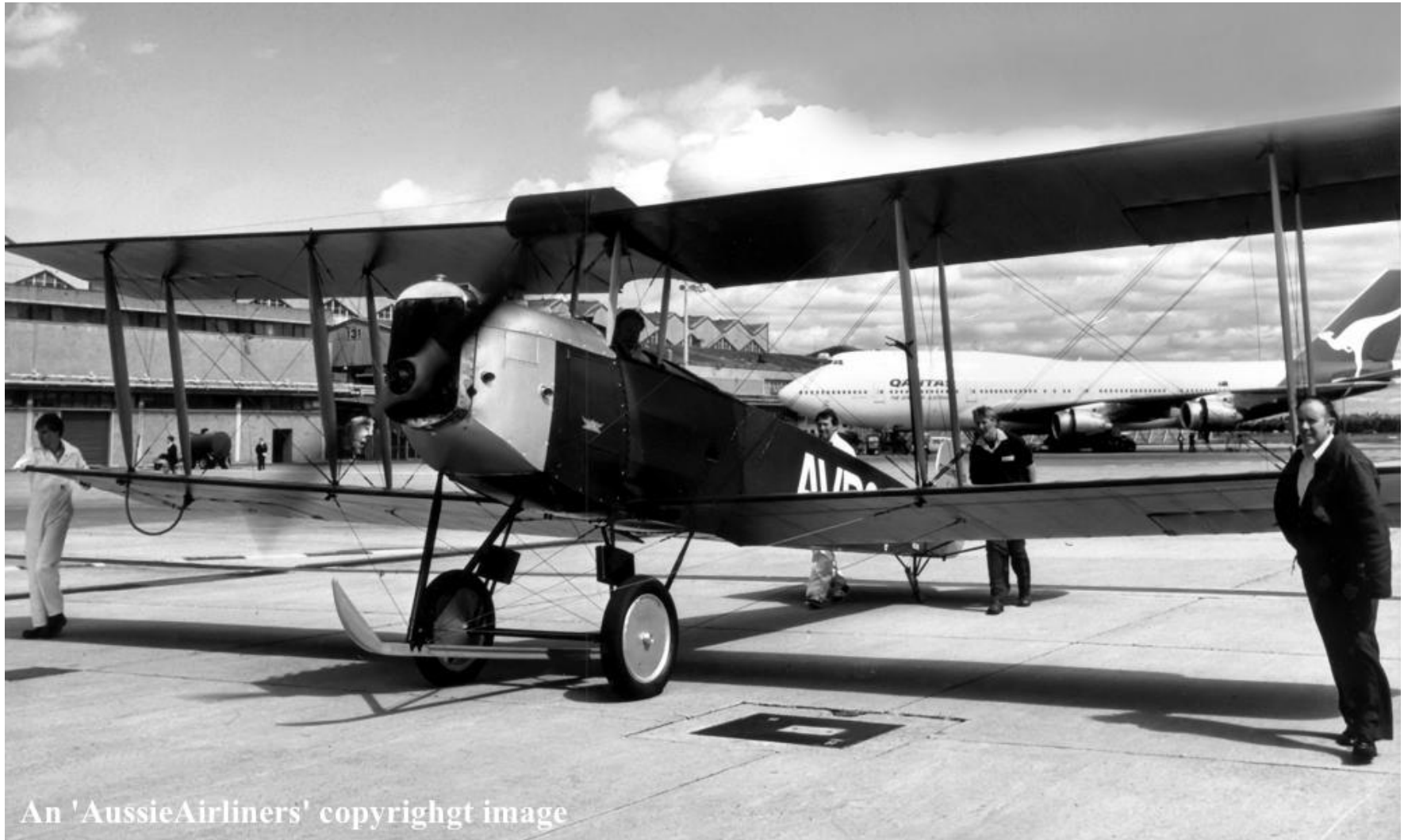
'G-AUBG' – Avro 504K. Sydney Kingsford Smith Airport, date unknown.

Queensland & N. T. Aerial Service Pty Ltd