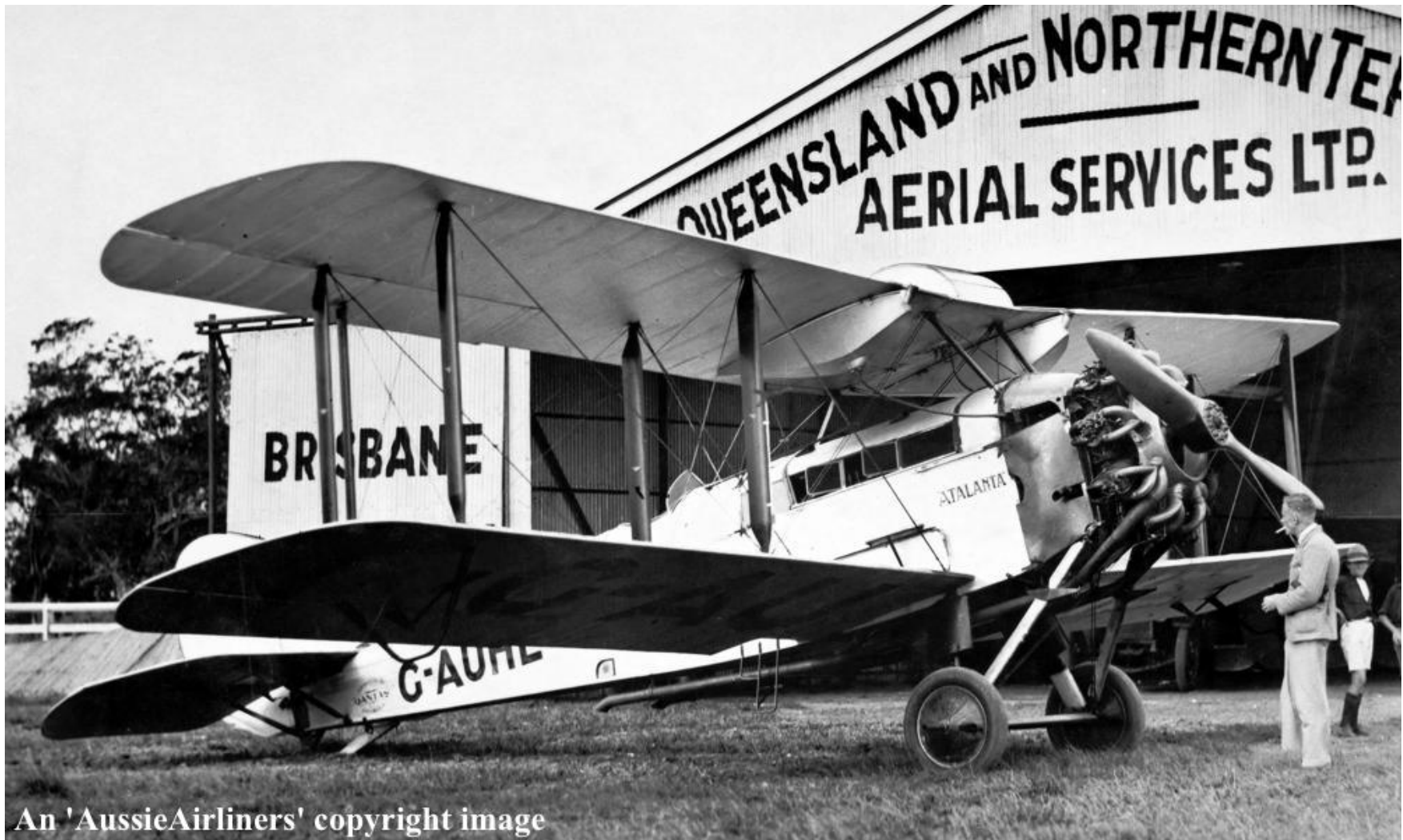
G-AUHE. 'Atalanta' – de Havilland DH.50J. Brisbane Airport, date unknown.

The 'Qantas' titles were located on the rear fuselage.