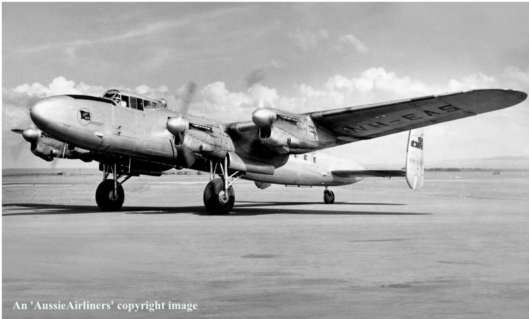
VH-EAS. Avro 691 Lancastrian Mk 1. Unknown airport, date unknown.

Qantas Empire Airways – all-metal livery